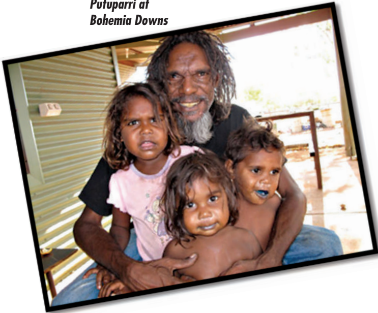
Putuparri at Bohemia Downs